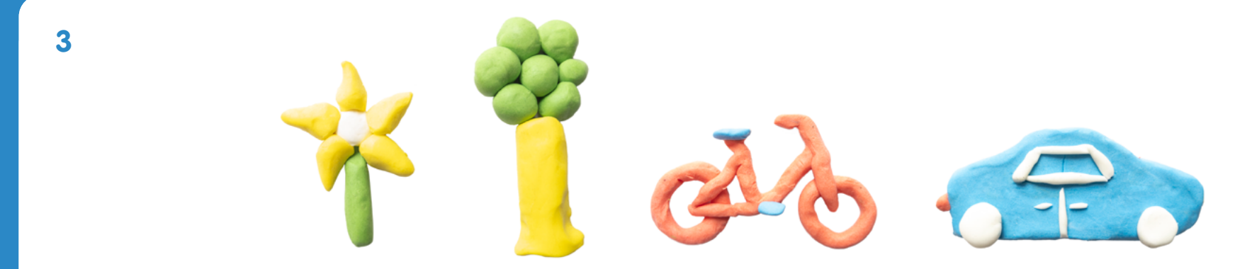
The children each think of two words that are related to each other. Let the children depict the words in clay. Let the children depict the words in clay.

Put all the clay items on a table. Ask the students to search for the words that belong together. Why do the words belong together?